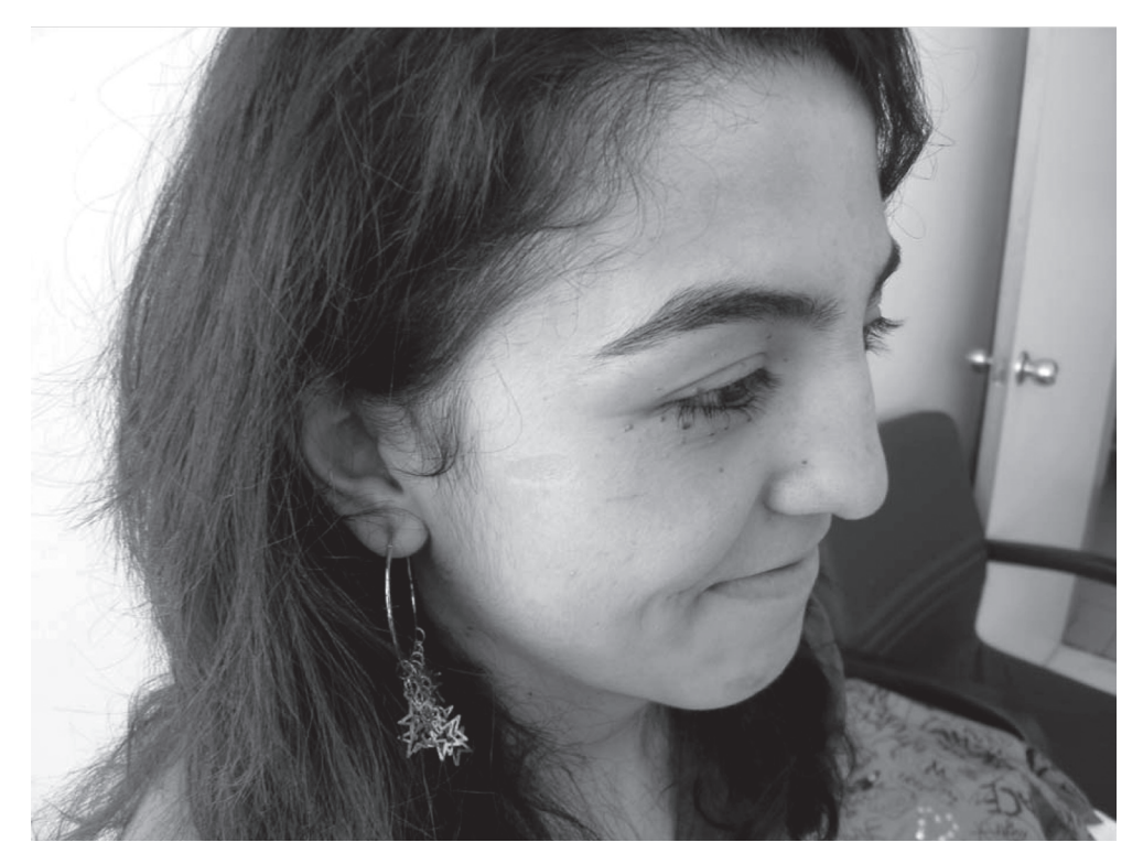
Figure 2. Note the basal cell nevi in the periorbital region.