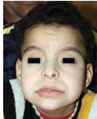
Figure 1. Frontal view of the patient's head at 9 months of age.

On examination, she could not speak or walk, her weight was 20.5 kg (3-10 percentile) and height was 110 cm (below 3 percentile). She had a prominent forehead, high frontal hair line, low-set ears, sparse eyebrows, hypertelorism, full cheeks, long philtrum, high arched palate, macroglossia, gingival hypertrophy, mandibular prognathism and muscular hypotonia (Figure 1). She also had hypermobile joints and pes equinovarus of the left foot. Cranial computed tomography showed bilateral frontal subdural hygroma (Table 1). Her other system examinations were normal.