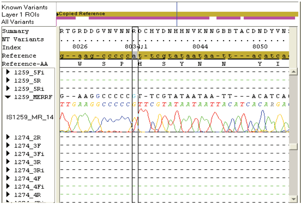
Figure 2. Sequencing-based identification of the complex IV mutation: m.8033A>G, p.(Ile150Val).

The autism spectrum disorders are clinically and etiologically heterogeneous developmental disorders of the brain. Many causes of autism have been proposed, but understanding of the etiology of ASDs is incomplete. The brain is strongly dependent on the ATP production of the mitochondrion, and the high energy demands of the brain and nervous system make them particularly vulnerable to impaired energy production. Recent epidemiological studies indicate that the incidence of mitochondrial disorders in children with autism could be 550 to 770 times higher than that of the general population [15]. All these facts have led several researchers to explore mitochondrial respiratory chain disorders as potential risk factors in ASDs. Multiple studies have confirmed the role of mitochondrial dysfunctions in ASDs [4-6,15,16]. For most individuals with defects of oxidative phosphorylation, the diagnosis is made through the determination of the activities